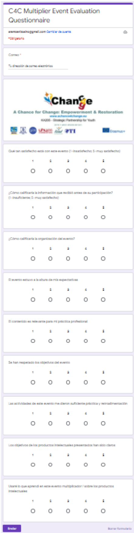
Annex 3. Evaluation Questionnaire Template (translated to Spanish)